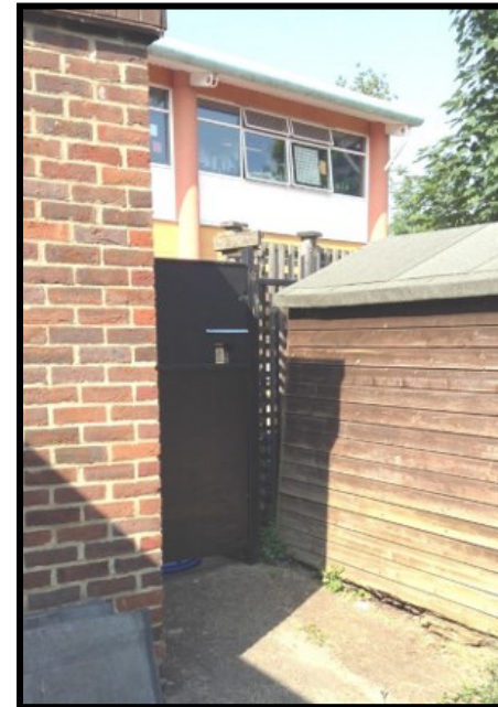
You will use this gate at first