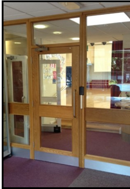
The front entrance