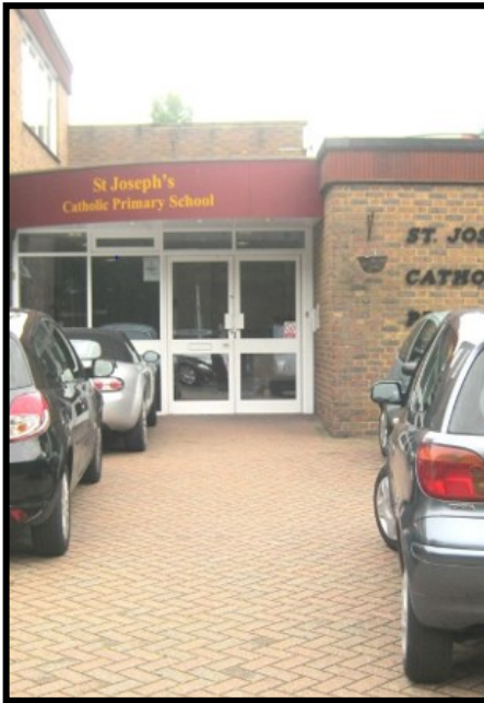
The front door